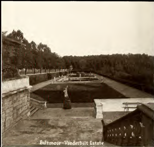
Biltmore - Vanderbilt Estate

NEIGHBORING POINTS OF INTEREST OF BLUE RIDGE